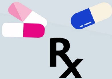
Total Commonly Prescribed Opioids-related ED Visits -by Age Group in Texas in 2017